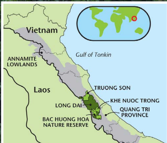
Khe Nuoc Trong in Vietnam, one of the most biologically diverse countries on Earth

As a Carbon Balanced Printer, we can also provide periodical certificates showcasing the total CO 2 you have balanced over a period of time. These certificates make a powerful addition to your CSR reporting and customer communications.